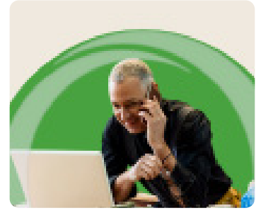
Recognize & Report Phishing Be cautious of unsolicited messages asking for personal information. Avoid sharing sensitive information or credentials with unknown sources. Report phishing attempts and delete the message.

Let's work together to build a safer digital world. We can increase our online safety through four simple actions, and whether at home, work or school, these tips make us more secure when connected. Take time to discuss them with family, friends, employees and your community so we can all become safer online!